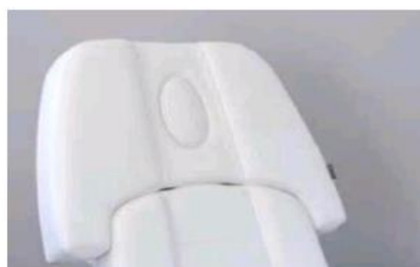
XL widening with nose slot for prone position