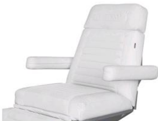
Lina with supersoft upholstery

*Illustration picture. The offered color combination may differ.