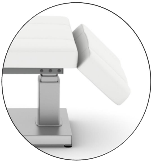
Pro version with adjustable foot rest: