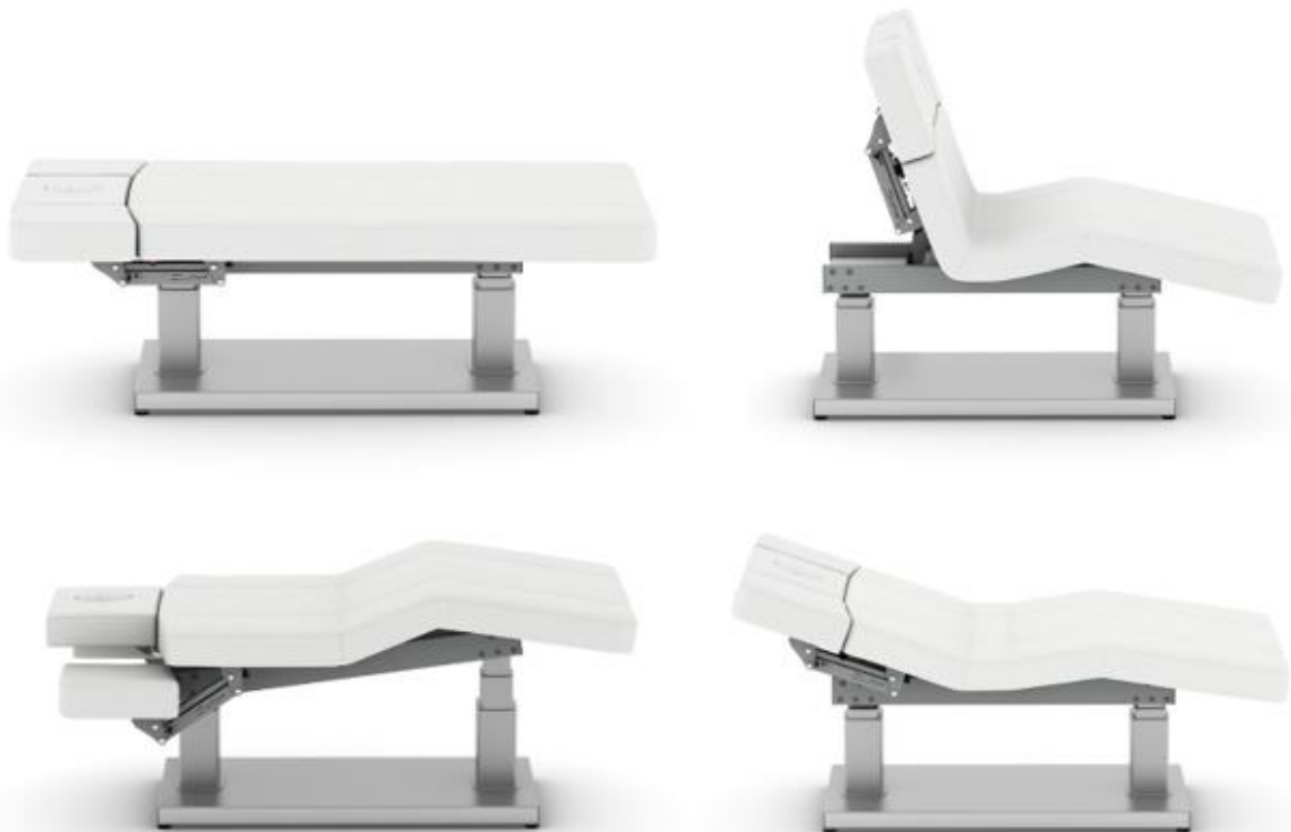
Illustration pictures - offered options and colors might differ